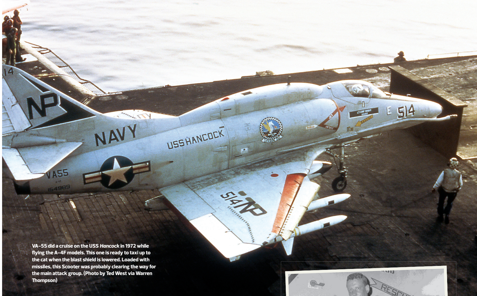
VA-55 did a cruise on the USS Hancock in 1972 while flying the A-4F models. This one is ready to taxi up to the cat when the blast shield is lowered. Loaded with missiles, this Scooter was probably clearing the way for the main attack group.

seeking missile right into Charlie's Skyhawk. The combat veterans from the previous year's cruise were telling all us nuggets on our first combat cruise that we were about to "see the elephant" and that once this mission was over, we would have seen it all.