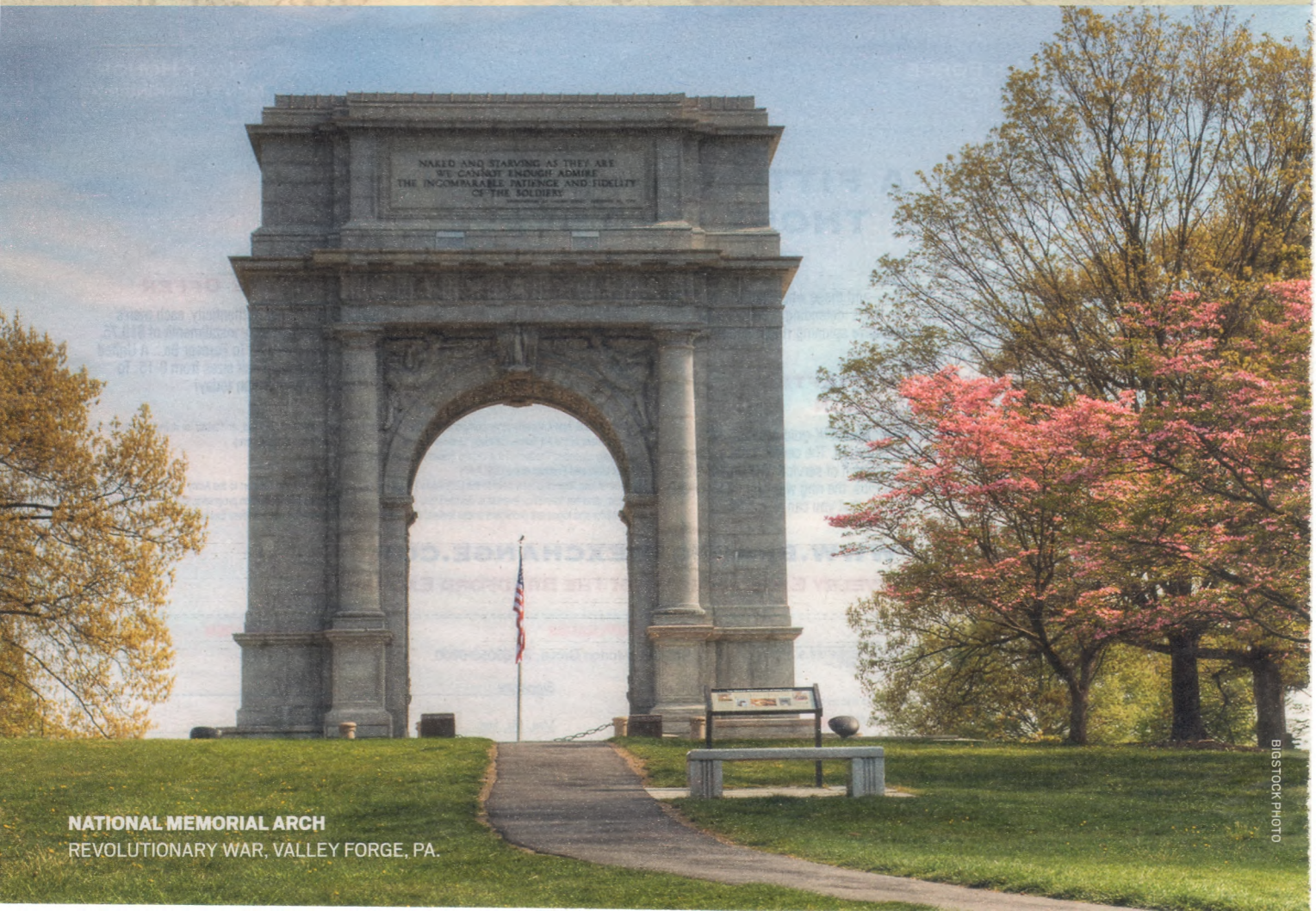
NATIONAL MEMORIAL ARCH REVOLUTIONARY WAR, VALLEY FORGE, PA.