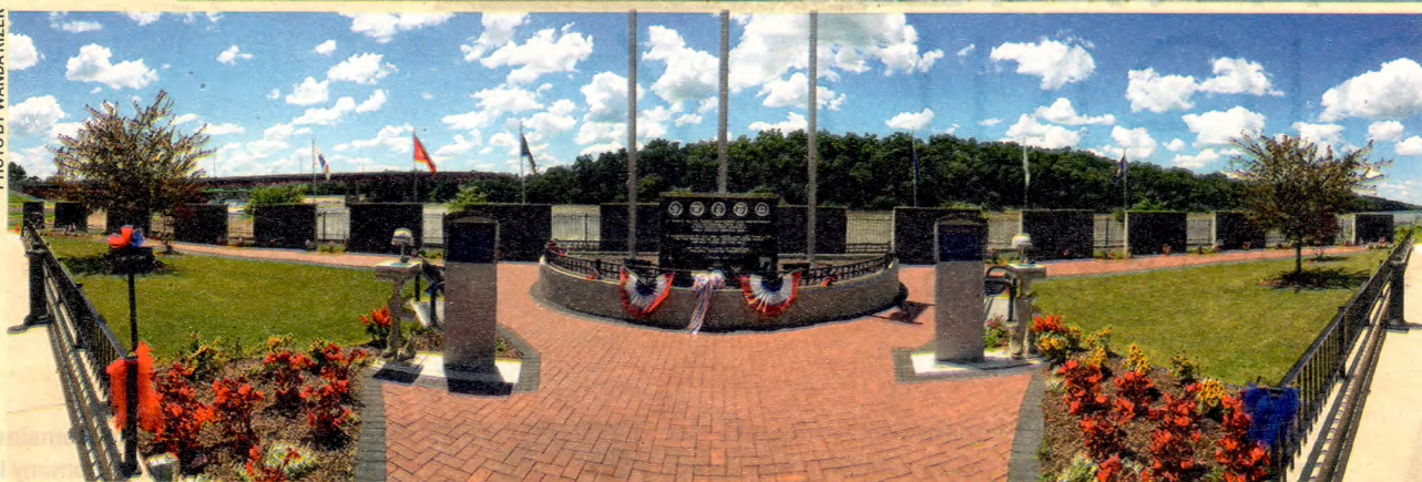
MIDDLE EASTERN CONFLICTS MEMORIAL WALL MARSEILLES, ILL.