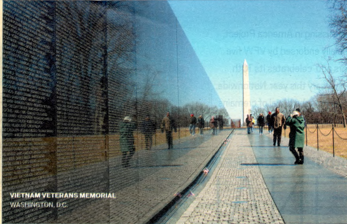
VIETNAM VETERANS MEMORIAL WASHINGTON, D.C.