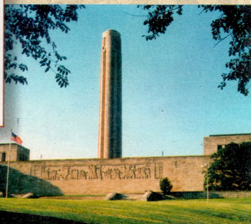
LIBERTY MEMORIAL, WWI KANSAS CITY, MO.