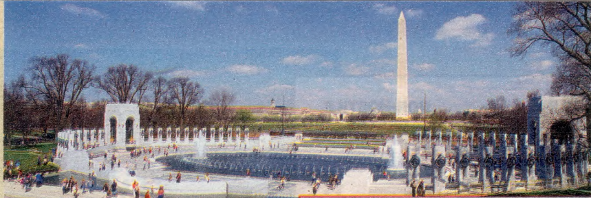
NATIONAL WWII MEMORIAL PHOTO