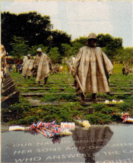
KOREAN WAR MEMORIAL WASHINGTON, D.C.